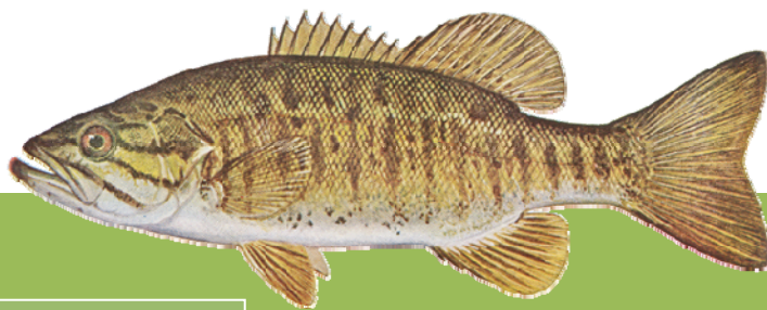
smallmouth bass ( Micropterus dolomieu )